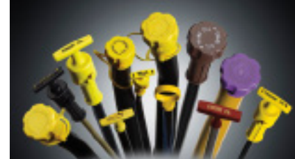
FLUID LEVEL INDICATORS