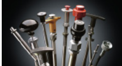
MECHANICAL CONTROL CABLES