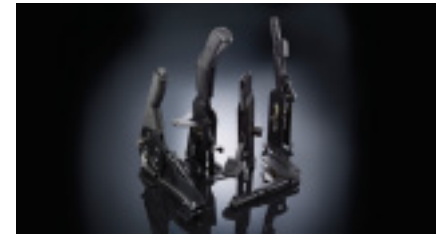
PARK BRAKE SYSTEMS